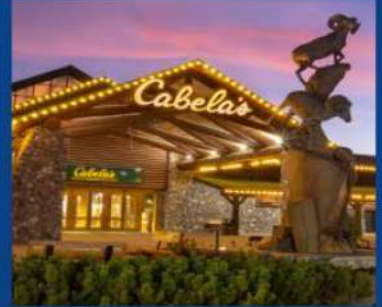
RENO-TAHOE DST CABELA'S