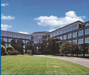
LAKE FOREST DST PACTIV HQ