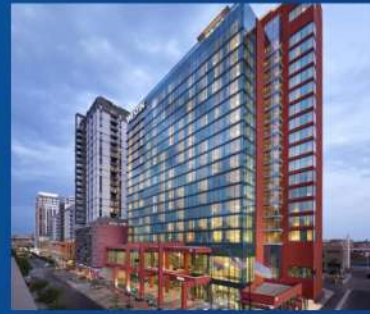
THE WESTIN TEMPE BY MARRIOTT, TEMPE, AZ