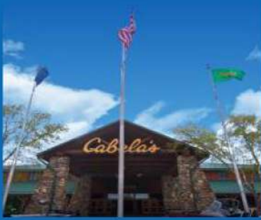
KANSAS CITY, DST CABELA'S