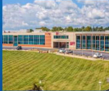
MEDICAL PRODUCTS DST KEWAUNEE SCIENTIFIC