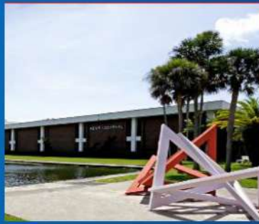
DAYTONA BEACH, DST GANNETT MEDIA